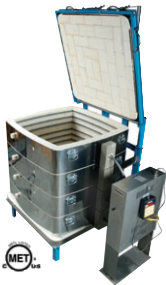
This is L&L's classic production kiln. Great for Universities too.

Vent-Sure Downdraft Kiln Vent System (See page 11) ..... $440 (Kilns over 20 Cubic feet may need an extra vent)