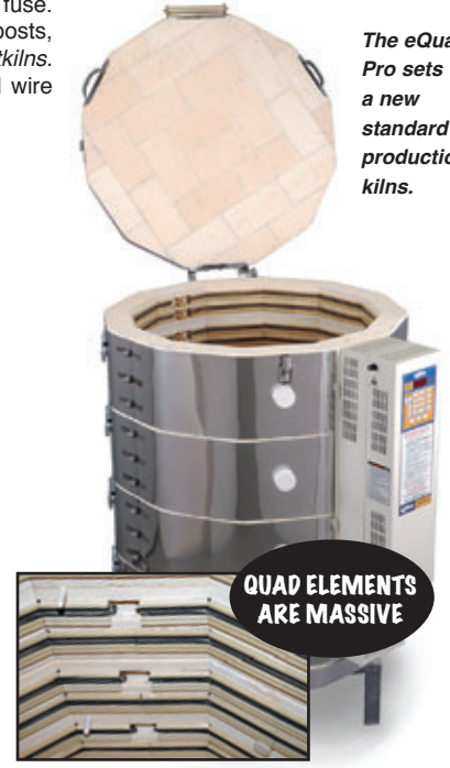
The eQuad-Pro sets a new standard in production kilns.

*Note: Special model eQ2836-X-208-1P is available with 16.6 KW, 208 Volt/1 Phase, 80 amps for a 100 amp fuse. Furniture Kit: includes the shelves listed above plus six (6) each of 1/2", 1", 2", 4", 6" and 8" high square posts, plus insulated gloves for unloading, and 5 lbs of Cone 10 kiln wash. Cone Rating: Cone 10 More: See hotkilns.com/spec-equad-pro for additional information like shipping dimensions, electrical ratings, fuse sizes and wire connection sizes. For controls see hotkilns.com/dynatrol and hotkilns.com/zone-control .