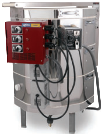
This is the original L&L manual kiln with manual infinitely variable zone control.

Furniture Kit: includes the shelves listed above plus six (6) each of 1/2", 1", 2", 4", 6" and 8" high square posts, plus insulated gloves for unloading, and 5 lbs of Cone 10 kiln wash. You can substitute two half shelves for one full shelf at no charge. Cone Rating: See chart above. More: See various Jupiter Manual specification sheets at hotkilns.com/spec-jupiter for additional information like shipping dimensions, electrical ratings, fuse sizes and wire connection sizes. (CAUTION: Kiln Sitters are not as reliable as shut-off devices as digital controls. Be sure to fire these kilns attended and use witness cones and/or a pyrometer).