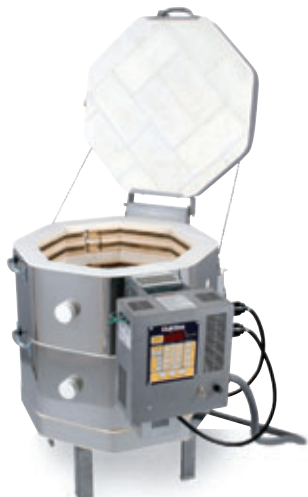
This is the "Thoroughbred" of kilns. Designed specifically for Crystalline Glaze firing - fast, responsive and precise.

We can make a large number of variations on this design - for instance to accommodate industrial processes. We can offer thicker firebrick, multi-layered insulation, many different sizes, more power and many other options too numerous to mention. Please contact the factory to discuss your requirements.