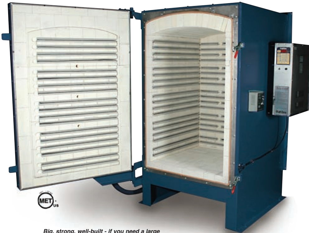
Big, strong, well-built - if you need a large front-loading kiln we have it. L&L has been building front-loading kilns for over 60 years.

Furniture Kit: includes twelve each (two large post kits) 1/2", 1", 2", 4", 6", & 8" high 1-1/2" square ceramic posts, insulated gloves for unloading and 5 lbs of Cone 10 kiln wash. Cone Rating: Cone 10 More: See hotkilns.com/spec-easy-load for additional information like shipping dimensions, electrical ratings, fuse sizes and wire connection sizes. For controls see hotkilns.com/dynatrol and hotkilns.com/zone-control . Easy-Load kilns are only sold directly through the factory.