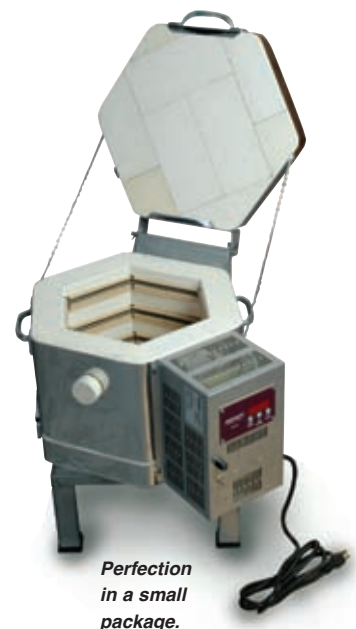
Perfection in a small package.

Same as the automatic with the One-Touch™ Program Control except it has the 24-Key DynaTrol (single zone version).