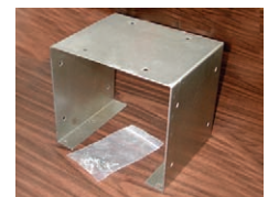
The Multi-Mounting Bracket