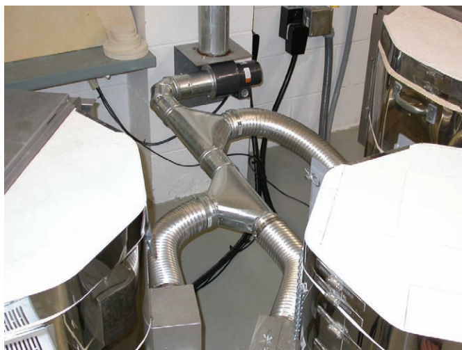
This shows several small kilns hooked up with one Vent-Sure using two Vent-Doublers. (Up to 20 cubic feet can be ventilated with one vent).

Note: These Frequently Asked Questions are provided courtesy of The Edward Orton Jr. Ceramic Foundation with some modification based on our Vent-Sure vent system and experience.