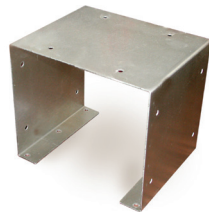
The Multi-Mounting Bracket

An adapter to mount the vent motor on the floor or point the outlet vertically for ceiling installations.