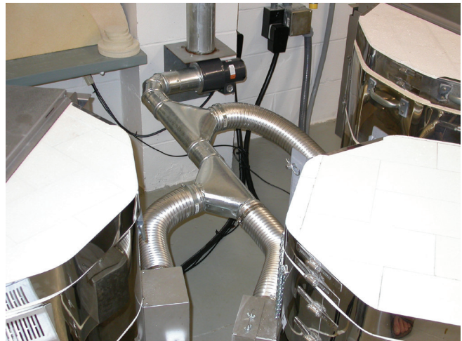
This shows several small kilns hooked up with one Vent-Sure using two Vent-Doublers. (Up to 20 cubic feet can be ventilated with one vent).

Note: These Frequently Asked Questions are provided courtesy of The Edward Orton Jr. Ceramic Foundation with some modification based on our Vent-Sure vent system and experience.