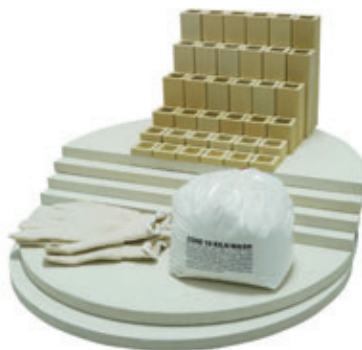
Furniture kit for a SM23T-3 kiln.

General Dimension Drawings: PDFs of all General Dimension drawings of the comparable e23T, e23T-3 and e28T-3 can be downloaded from each model page on our web site.