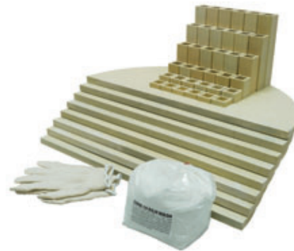
Furniture kit for a SM28T-3 kiln.