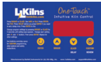
One-Touch™ Intuitive Kiln Control

Vent System: Vent-Sure downdraft vent (see hotkilns.com/vent.pdf )