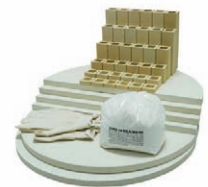
Furniture kit for a JD230V-3.