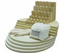
Furniture kit for a JD245V-3.