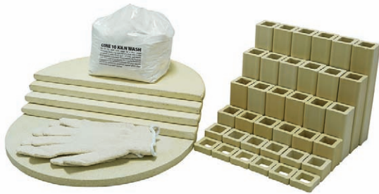
Furniture kit for a JD18

For all Dimensions and Weights: See hotkilns.com/jupiter-dimensions.pdf.