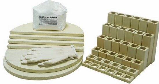
Furniture kit for a JD18X