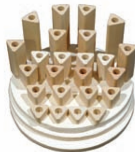
Furniture kit for a Fuego kiln.

Furniture / Accessory Kit: Two 30.5 cm (12") full round shelf, one 30.5 cm (12") half shelf, four each 1.25 cm (1/2"), 2.5 cm (1"), 3.75 cm (1-1/2"), 5 cm (2"), 6.25 cm (2-1/2"), and 7.5 cm (3") triangular posts plus one pound of Cone 10 kiln wash.