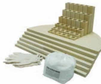
Furniture kit for a e28S-3 kiln.