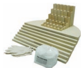
Furniture kit for a e28T-3 kiln.