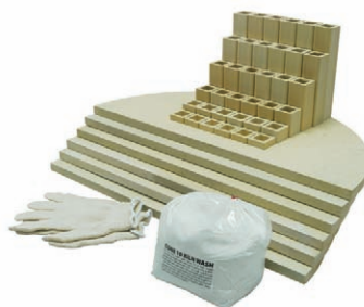
Furniture kit for a e28S-3 kiln.