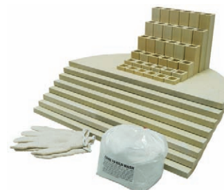
Furniture kit for a e28T-3 kiln.