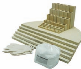
Furniture kit for a e28S-3 kiln.

Quad Element Design: Extra long element life ( hotkilns.com/quad-element-option )