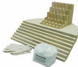
Furniture kit for a e28T-3 kiln.