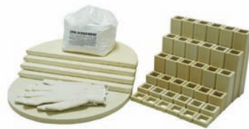
Furniture kit for a e18S kiln

Furniture Kits: Shelves are high alumina cone 11 shelves. Shelves are 15" diameter for kilns with 3" brick and 15.5" diameter for kilns with 2.5" brick. Full and half round cordierite shelves. Each post kit includes six each 1/2", 1", 2", 4", 6" and 8" high 1-1/2" square cordierite posts. All furniture kits include heat-resistant gloves and 1 lb of cone 10 kiln wash.