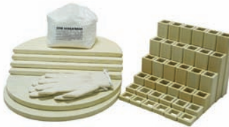
Furniture kit for a e18T kiln