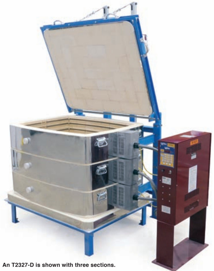
An T2327-D is shown with three sections. The control panel is mounted on the right side of the kiln.

UL Listing: c-MET-us listed to UL499 standards.