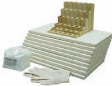
Furniture kit for an T2327-D

Shelves are high alumina cone 11 shelves. Shelves are 11" x 22" x 3/4". See below for quantity. Each post kit includes six 1/2", 1", 2" 4", 6" and 8" high 1-1/2" square cordierite posts. All furniture kits include, heat-resistant gloves.