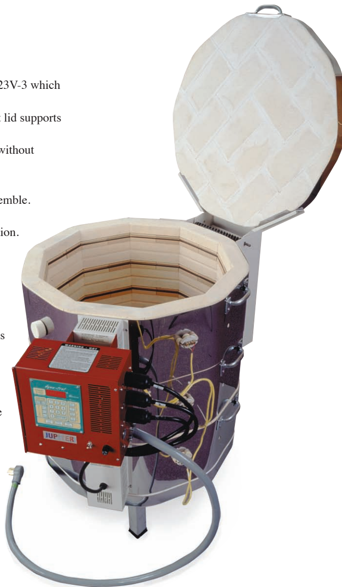
A JD230V-3 is shown with three sections.

UL Listing: c-UL-us listed to UL499 standards.