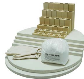
Furniture kit for a JD230V-3.

For all Dimensions and Weights: See hotkilns.com/jupiter-dimensions.pdf .