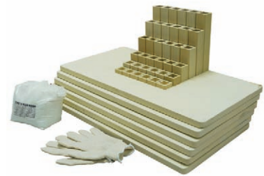
Furniture kit for an X3227-D.

Bell-Lift Dimensions: See hotkilns.com/lift.html.